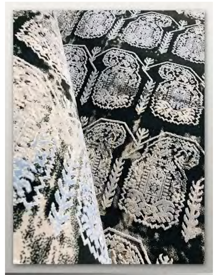
Collection : Black Swan - 205 Design : Vintage Carpet Yarn: Acrylic Reeds: 700 Density/Sqm : 2100