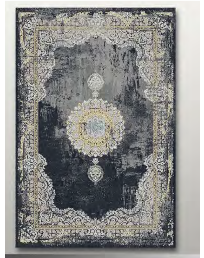
Collection : Black Swan - 206 Design : Vintage Carpet Yarn: Acrylic Reeds: 700 Density/Sqm : 2100