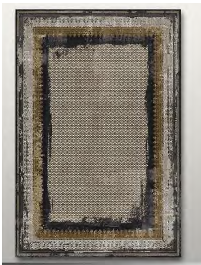
Collection : Black Swan - 217 Design : Vintage Carpet Yarn: Acrylic Reeds: 700 Density/Sqm : 2100