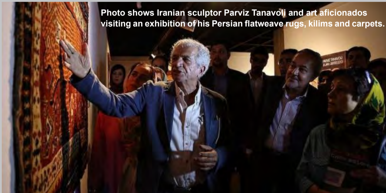
Photo shows Iranian sculptor Parviz Tanavoli and art aficionados visiting an exhibition of his Persian flatweave rugs, kilims and carpets.