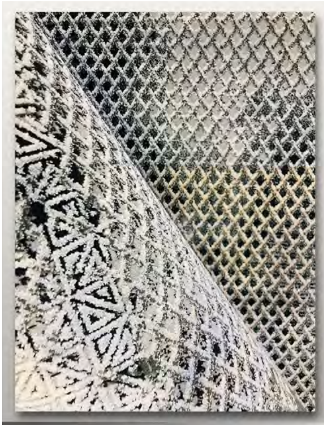
Collection : Black Swan - 209 Design : Vintage Carpet Yarn: Acrylic Reeds: 700 Density/Sqm : 2100