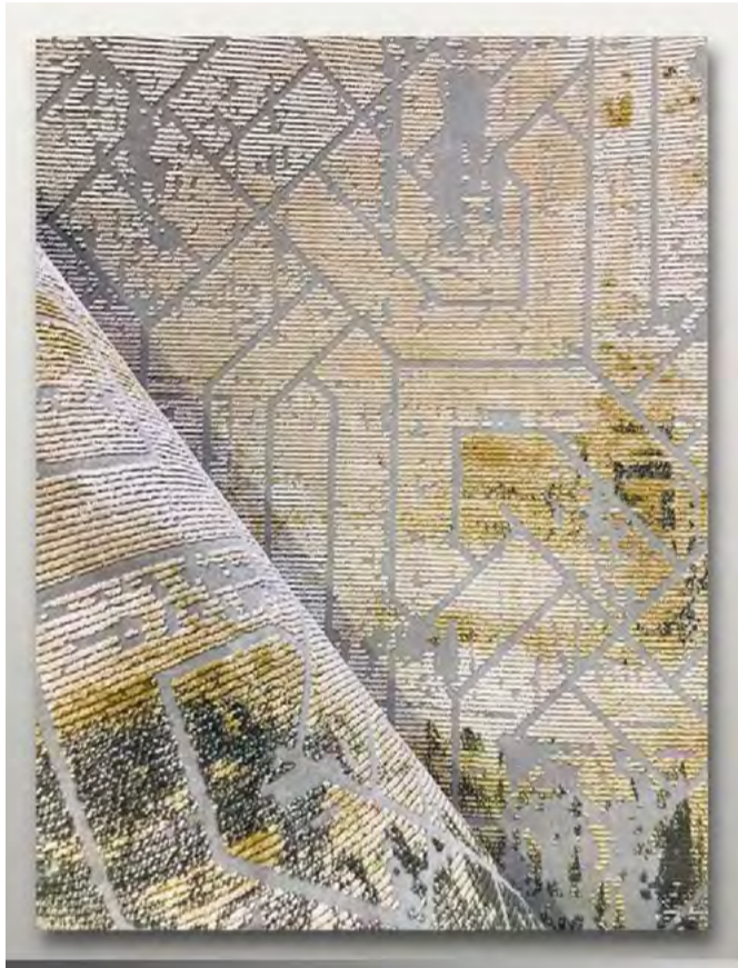
Collection : Black Swan - 219 Design : Vintage Carpet Yarn: Acrylic Reeds: 700 Density/Sqm : 2100

7/24 Online Support / WhatsApp: +905392346324