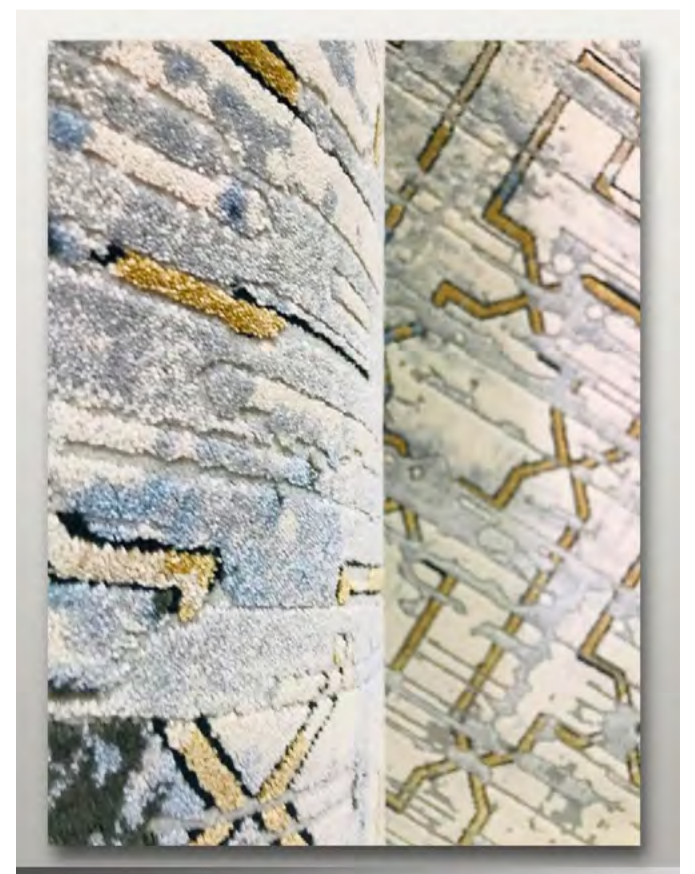
Collection : Black Swan - 212 Design : Vintage Carpet Yarn: Acrylic Reeds: 700 Density/Sqm : 2100