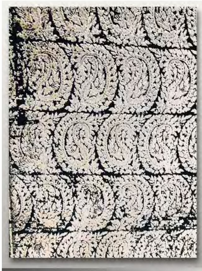
Collection : Black Swan - 211 Design : Vintage Carpet Yarn: Acrylic Reeds: 700 Density/Sqm : 2100