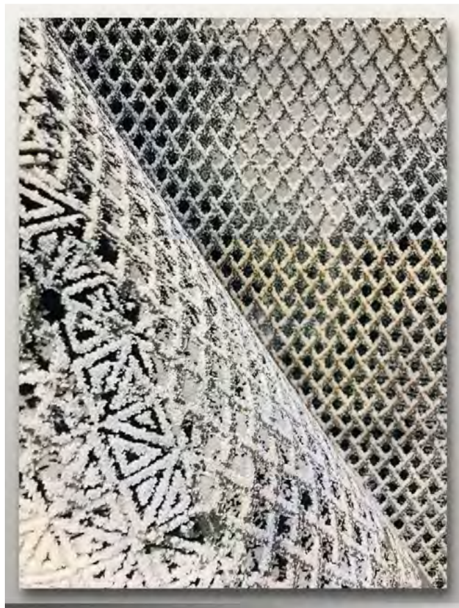
Collection : Black Swan - 209 Design : Vintage Carpet Yarn: Acrylic Reeds: 700 Density/Sqm : 2100