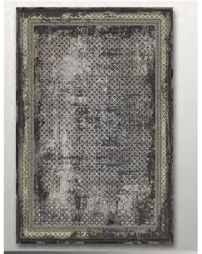
Collection : Black Swan - 216 Design : Vintage Carpet Yarn: Acrylic Reeds: 700 Density/Sqm : 2100