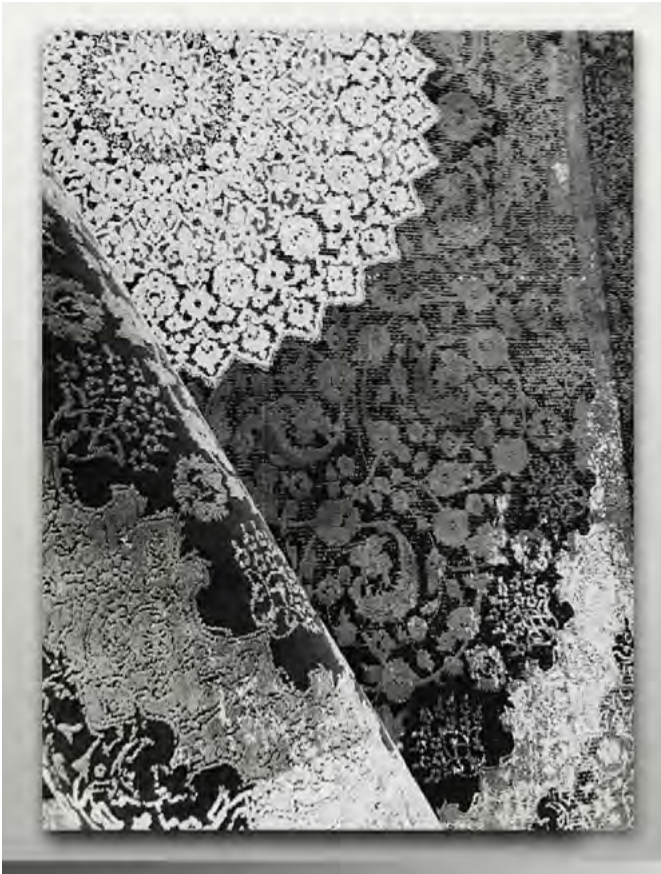
Collection : Black Swan - 201 Design : Vintage Carpet Yarn: Acrylic Reeds: 700 Density/Sqm : 2100