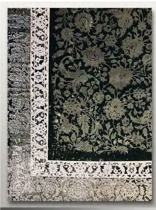
Collection : Black Swan - 207 Design : Vintage Carpet Yarn: Acrylic Reeds: 700 Density/Sqm : 2100